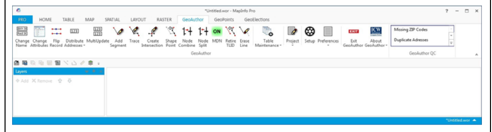
64 bit Version

The people at ICW have already initiated the recoding of our applications to facilitate their proper execution in the 64 bit version of MI Pro. Tabs, ribbons, groups, icons and more will be demonstrated at the GeoElections User's Conference. Input from all attendees will be appreciated.