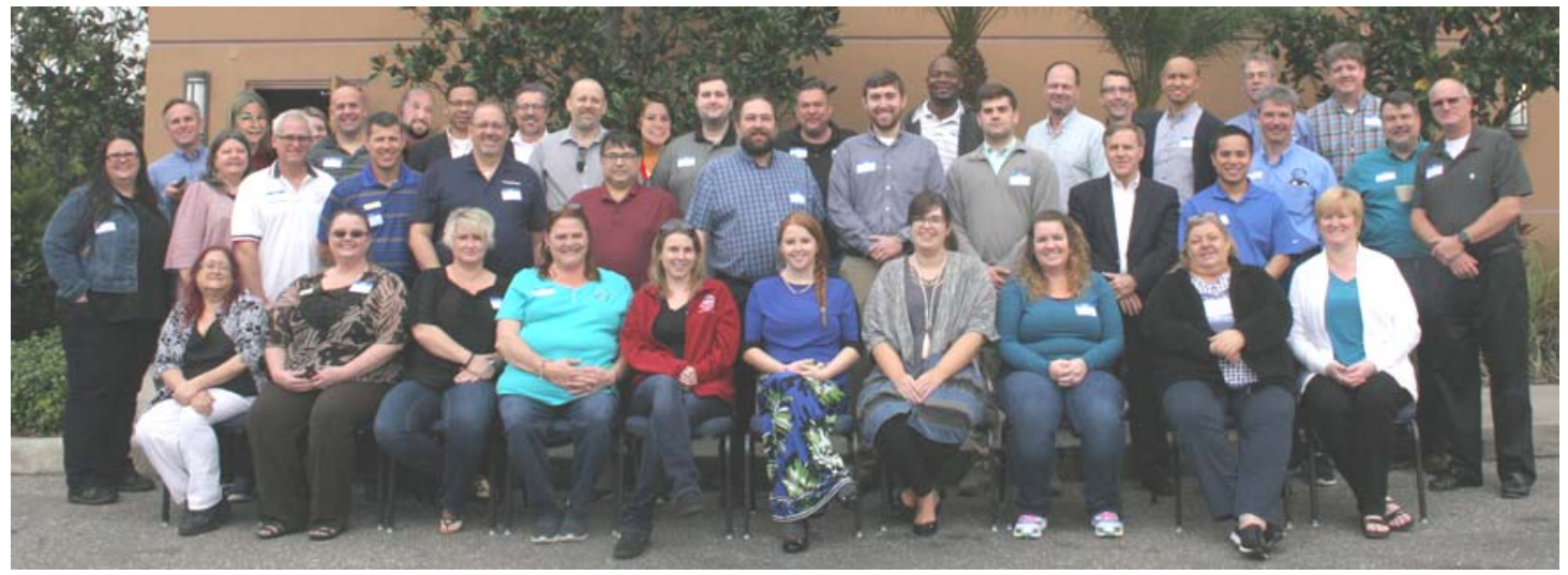
GeoElections Users from two states and speakers alike made the 16th a great conference!

The conference this year was dominated with a workshop based upon the US Census Phase II Data Redistricting (VTD) Program and the release of GeoAuthorVTD Edition. The people at ICW developed GeoAuthorVTD Edition to work with the VTD Partnership files. This is the 3<sup>rd</sup> decade ICW has offered software for this purpose. We conducted a one and a half day workshop learning how to edit the VTD Partnerships Shapefiles for return to the US Census Bureau. These edits included adding new features, updating municipal boundaries, adding hydrography, landmark areas and defining VTDs to define the boundaries of Census Blocks in the 2021 P.L. 94-171 version of the TIGER/Line Shapefiles.